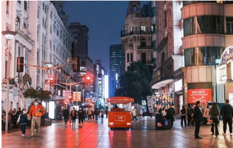
The bustling city center meets all shopping needs.