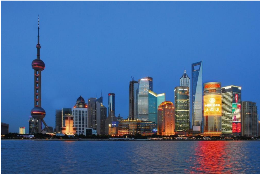
The left one is the Oriental Pearl Tower, a famous landmark in Shanghai.