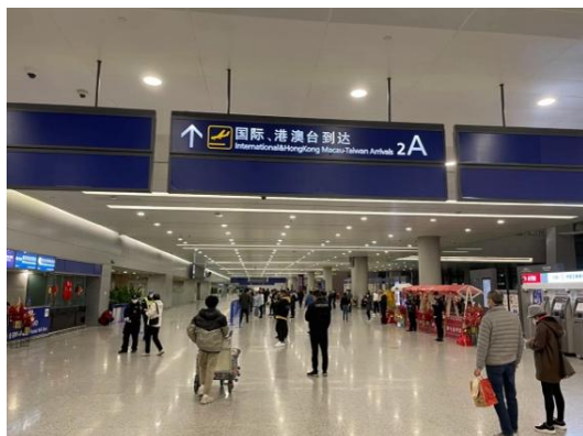
Arriving at Pudong International Airport

Shanghai is a bustling transportation nexus in China, travelers to Shanghai have the convenience of two international airports: Pudong International Airport and Hongqiao International Airport. Both are well-connected on domestic and international circuits. The city's public transportation system, which includes an extensive metro network, aids in efficient intra-city travel.