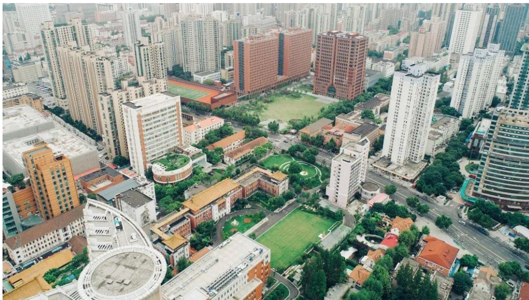
An aerial view of the entire college.