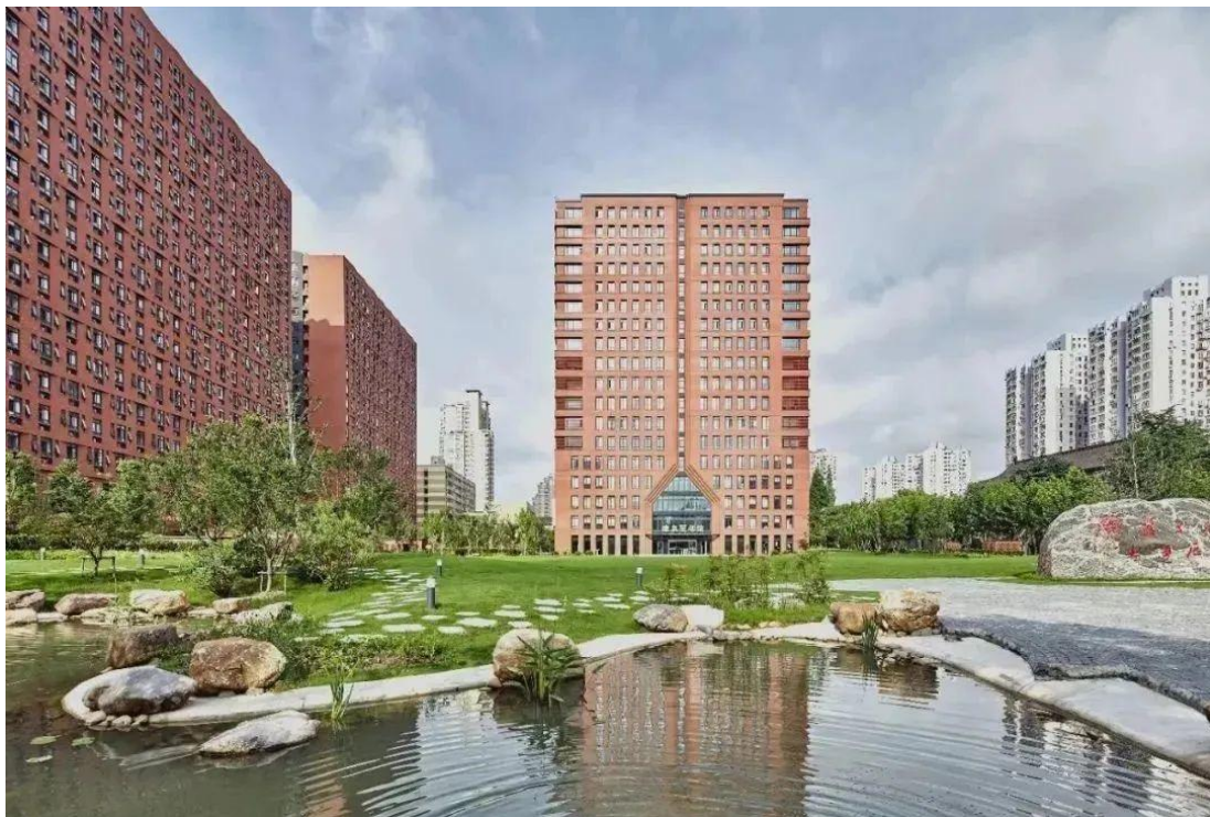
There are excellent facilities which will enable us run a successful Summer School.