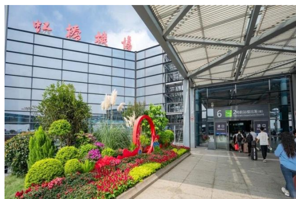
Arriving at Hongqiao International Airport