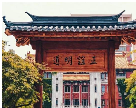
The motto of Shanghai Medical College