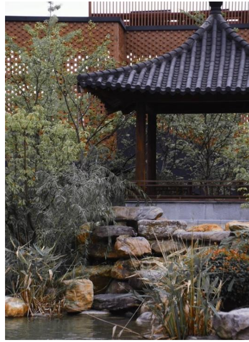
The picturesque corners of the campus.