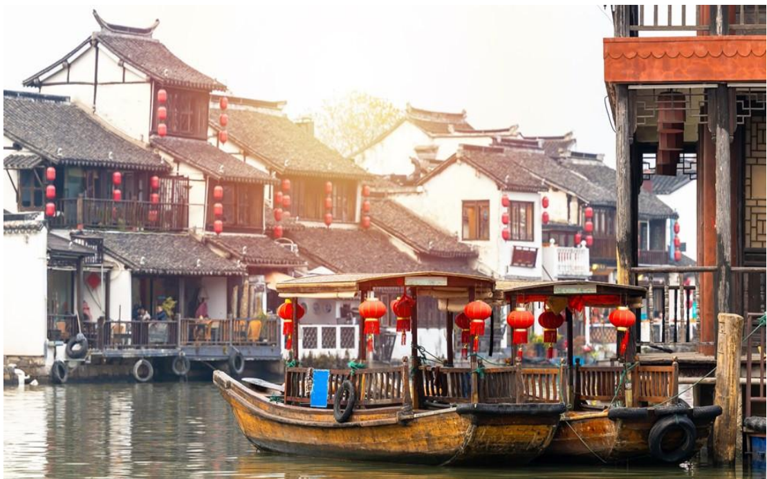
Zhujiajiao Water town (known as the Venice of Shanghai)

Looking forward to seeing you at the South-South Public Health Education Network Summer School in 2025!