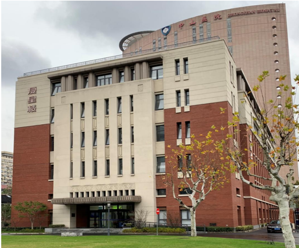
The academic building of the college and the Zhongshan Hospital behind it.