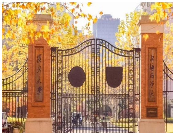
The grand entrance of the college.

At Master's level, the faculty currently hosts one interprofessional international master program – Master of Public Health, which is recruiting students with a broad background and aim to deliver an interprofessional approach to the courses taught.