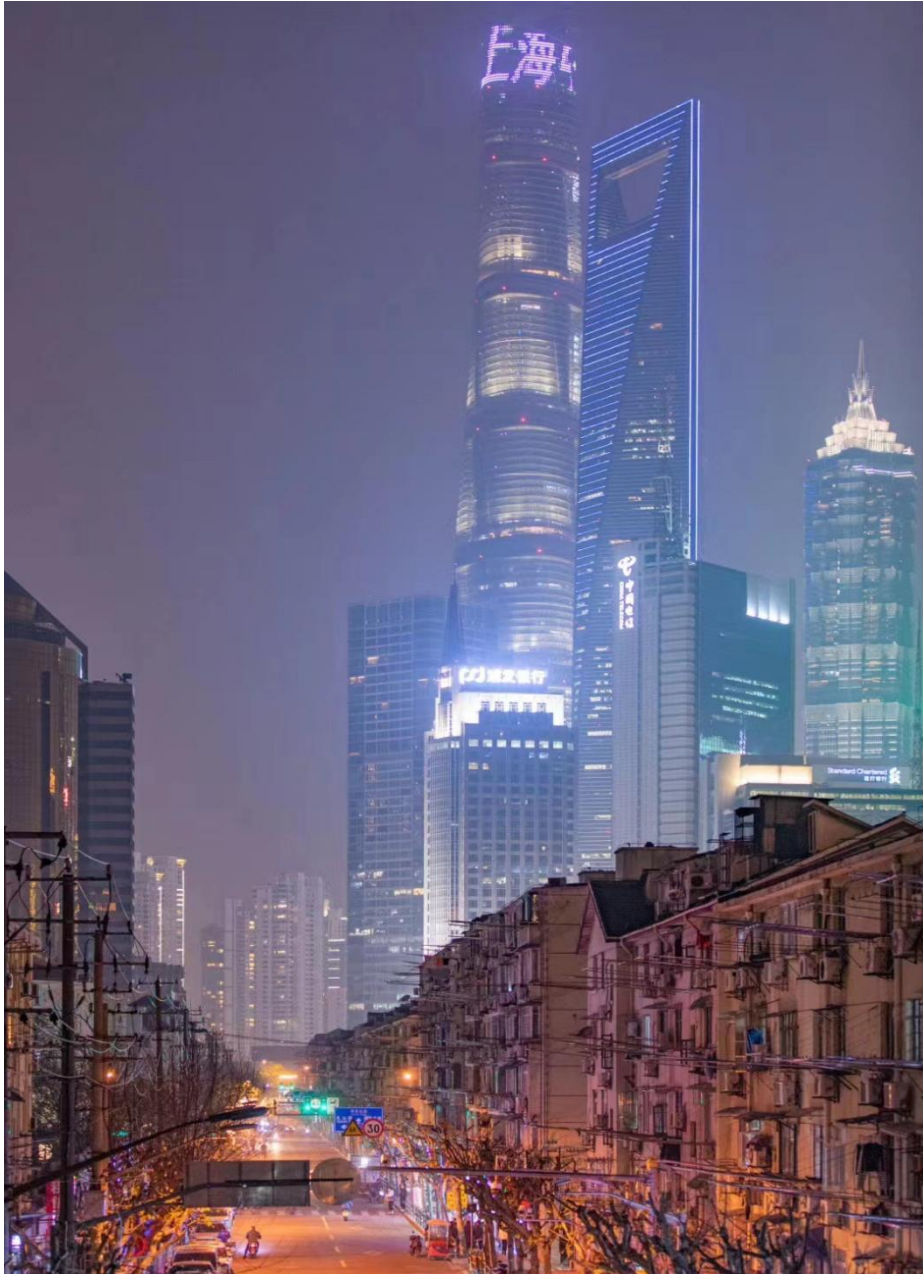
Shanghai's skyline showcases a blend of modern and traditional architectural styles.

Culturally, Shanghai offers a range of attractions. Its museums, theaters, and art galleries provide insights into both ancient and contemporary Chinese arts and lifestyles. For shopping aficionados, Nanjing Road and Huaihai Road are meccas of luxury, featuring high-end fashion boutiques and global brands. Neighborhoods like Tianzifang and Xintiandi allow visitors to glimpse Shanghai's historical and cultural layers.